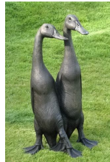
Indian runner ducks

Don't forget to log on regularly to see new work as it arrives