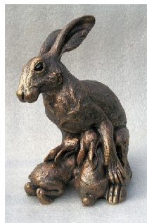
Hare feeding leverets