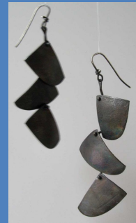
front-oxidised silver earrings. back -fine gold

The collection includes forged silver, silver and 18ct gold and single 18ct gold pieces. No picture can do justice to these pieces you must come in to see the collection.