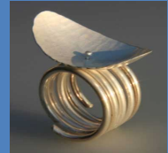
silver scoop ring